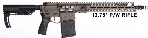
13.75" P/W RIFLE