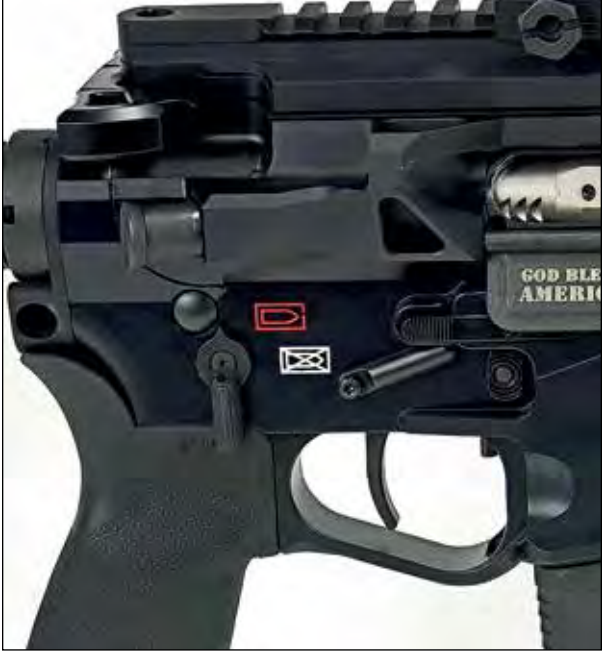
The upper (left) uses a 5.56mm NATO bolt carrier and POF-USA's E<sup>2</sup> extraction system while the Gen 4 lower (right) has fully ambidextrous controls.

of all of this effort is a comfortable. lightweight rifle that packs a much more powerful punch for serious threats.