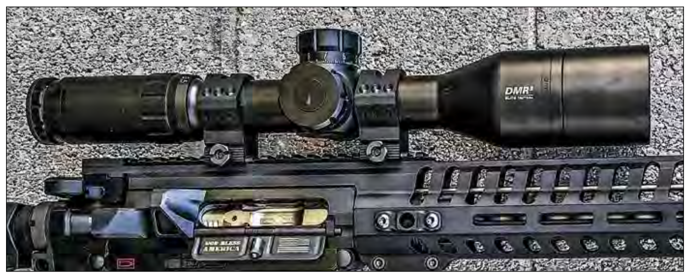
The flattop upper makes it easy to add optics like this Bushnell 3.5-21x50mm Elite Tactical DMR II, which the author used to easily tag targets at distance.